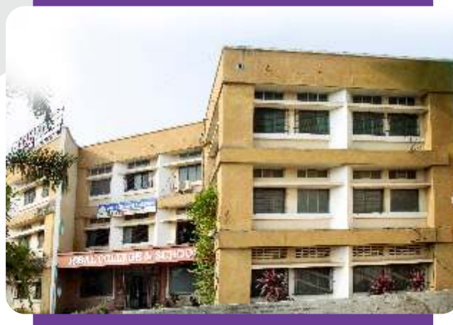
IDEAL COLLEGE OF EDUCATION