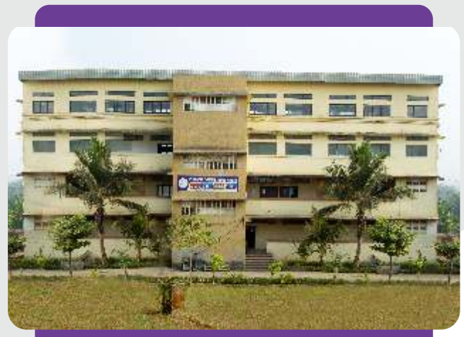
KONARK IDEAL COLLEGE OF SCIENCE & COMMERCE