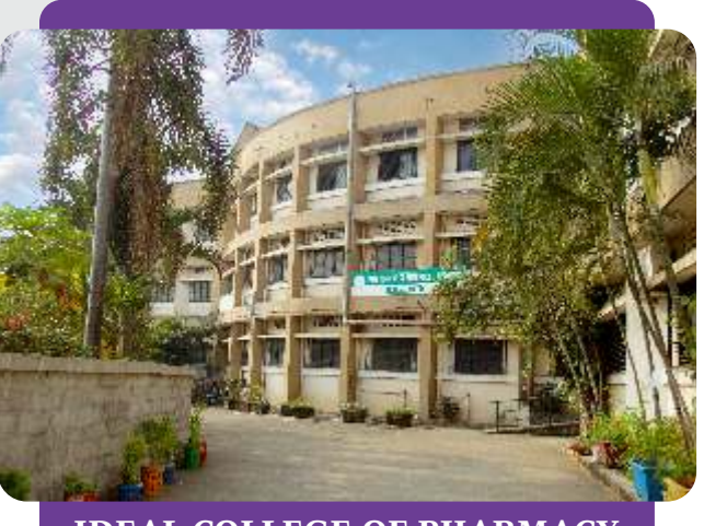
IDEAL COLLEGE OF PHARMACY & RESEARCH CENTER